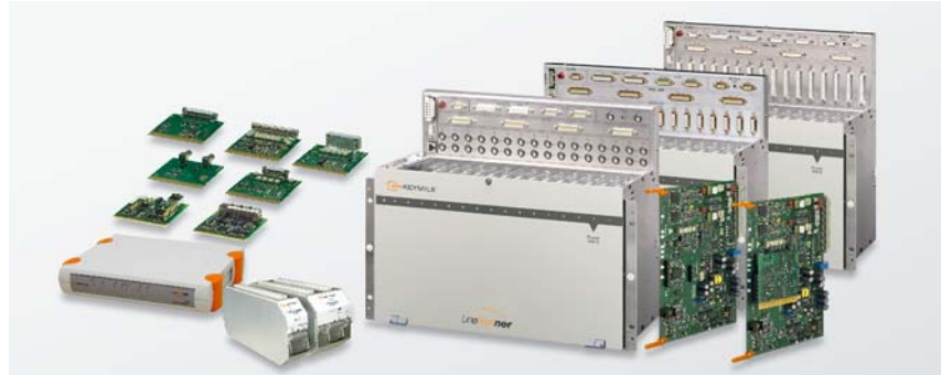
Figure 3: Units of the SHDSL transmission system: DTM, LCM and subracks

LineRunner LCM is available as 2-pair, LineRunner DTMs are available as 1-pair or 2-pair versions. 2-pair systems have a larger transmission range in comparison to 1-pair systems. All 2-pair systems can be switched to 1-pair mode via the network management.